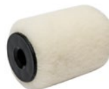
ROTO MERINO WOOL Product No 70090022