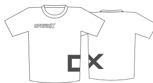
OPTIWAX T-SHIRT WHITE Product No 8300001