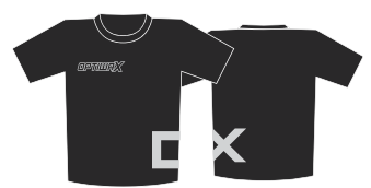
OPTIWAX T-SHIRT BLACK Product No 8310001